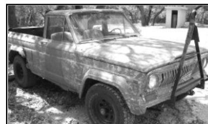
Recently donated hunting rig

To plug in to CTO, contact your Outfitter or the Central Office today! ☎